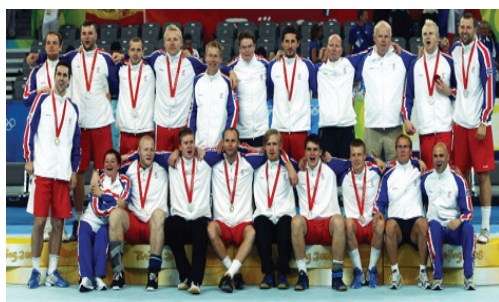
"our boys" (strákarnir okkar)

Bronze for Iceland. The European Handball Championship was held in Austria 19 - 31 January. The Icelandic Olympic Silver Medalist Team from Beijing last year came away from Austria as the Bronze Medalist, having only lost one game, to France the Gold Olympic Team as well as the World Champions and now also European Champions. The Icelandic Team, or "strákarnir okkar" ("our boys") as they fondly and proudly referred to by the 317 thousand Icelanders, proved in Austria that their Silver Olympic Medals were no accidents. Through their outstanding performance and sportsmanlike behaviour these young men gave the Icelandic National Spirit a welcomed boost at a time when there is much need for positive news. The final top National teams at the end of the European Championship in Austria are: France (gold), Croatia (silver), Iceland (bronze), Poland, Denmark and Spain. As "strákarnir okkar" came back to Reykjavik on 2 February they were welcomed by thousands, led by the Prime Minister of Iceland, Jóhanna Sigurðardóttir and the Minister of Culture and Sports, Katrín Jakobsdóttir. The well deserved result in Austria ensured Iceland a place in the World Championship competition in Sweden early in 2012. http://www.ehf-euro.com/Iceland.1841.0.html#