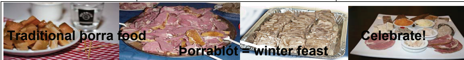
Traditional porra food