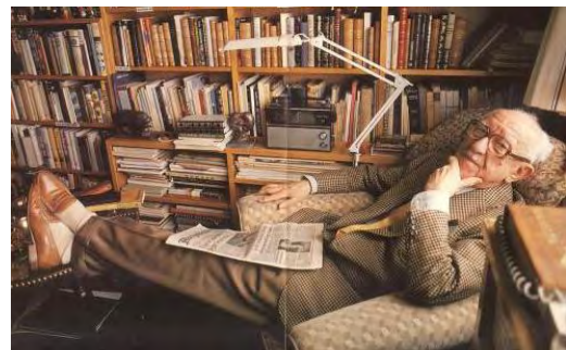
Nobel prize winner Halldór Laxness

The new translation, which is supported by the Arts Foundation of North Rhine-Westphalia ( Kunststiftung NRW ) will be published next year by S. Fischer Verlag . A team of translators is now hard at work on the texts. The edition will include an accompanying volume of annotations, providing historical background to the sagas, and placing them within the context of world literature.