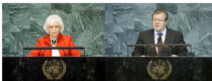
Prime Minister Sigurðardóttir

http://www.unmultimedia.org/tv/webcast/2010/09/iceland-mdg-debate.html